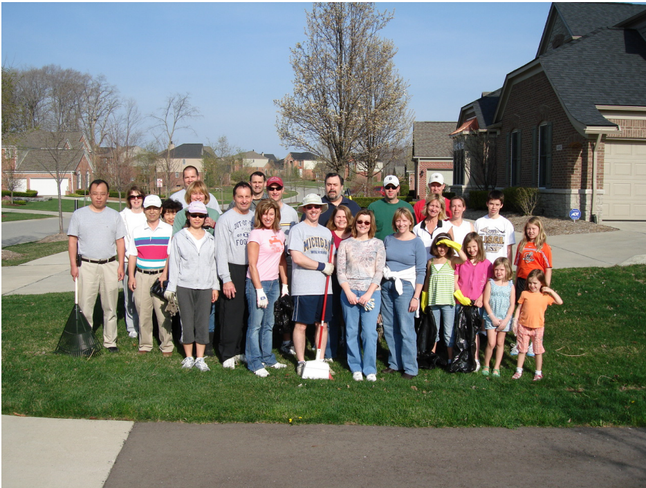
2009 SPRING CLEAN UP VOLUNTEERS

HELP CONTROL HOA DUES AND COSTS.... DO YOUR SHARE BY VOLUNTEERING SOME TIME